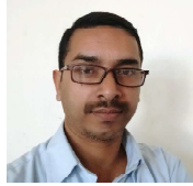
By: M.R. Lalu

The Indian National Congress has always been a momentous political force in India. Except for some occasional convulsions against the party and its rule by leaders like Jayaprakash Narayan, the Congress predominantly remained a powerful platform which could successfully withstand successive storms and sail the country through political whirlwinds. Its growth as a dominant political entity in India remained relevant until a political wind began to blow against it from the Sangh Parivar courtyard. The BJS (Bharatiya Janata Party), as that was the political outfit sprung from the stem of the parivar known as, was chiefly to propagate a new political ideology based on nationalistic principles and traditions. It consistently flapped its wings to fly beyond the terrain of power occupied by the Congress but failed to do anything significant until its new avatar, the BJP (Bharatiya Janata Party) came into being. India's political spectrum turned topsy-turvy almost permanently for the Congress soon after the advent of a chaitanya from Gujarat. Its hope to come back as it did in the previous periods did not fructify, and Modi in his full-fledged second term seems to have tightened his grip further and the Congress has almost become a boat without a rudder.