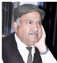
By: Vijay Garg

There is perhaps no need to mention the importance of freedom separately, because there have been so many ups and downs in its hunger all over the world. Its form has also changed according to the times and contexts. But what is the prevalent 'freedom' we talk about in today's era, and what is its meaning? Where does it begin... Whose freedom?